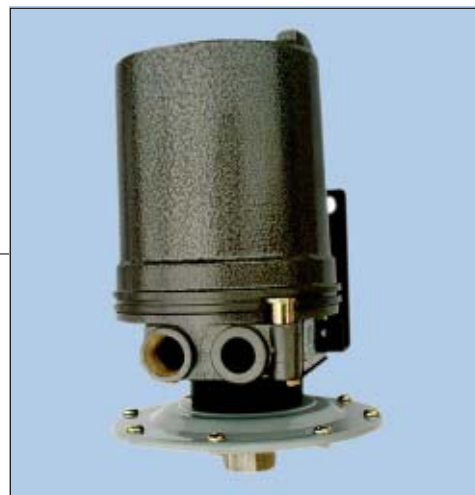
Model 020 in GK Flameproof Enclosure

SWITZER Series 020 pressure switches are specially designed for very low input pressure from mmWC and upto 4 bar for use in varied applications. Switzer's time proven Series 200 mechanisms are employed to ensure reliable switching.