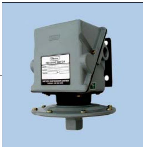
Model 020 in GM Weatherproof Enclosure